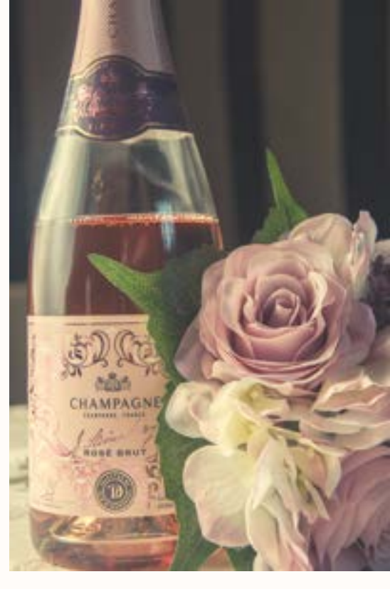
Thank you for making our day so special (and worry-free to boot) - it was everything that we pictured our wedding to be!