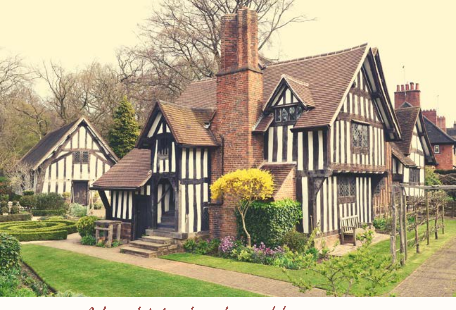
A beautiful intimate wedding venue in the heart of historic Bournville