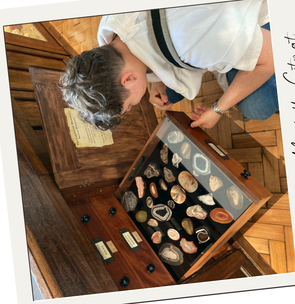
Using the Key to the City at Capwath Museum