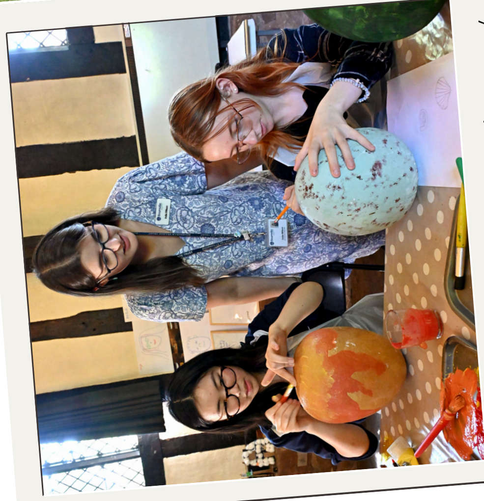
Preparing for School of Wizardry

"I've always loved history, but I've definitely become more interested in museums since being here."