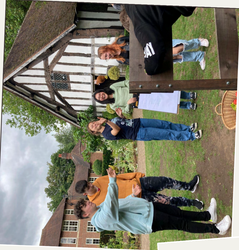
In the stocks

"I've always loved history, but I've definitely become more interested in museums since being here."