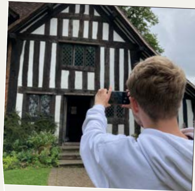
Exploring Selly Manor

Would you like to be involved in more heritage opportunities?