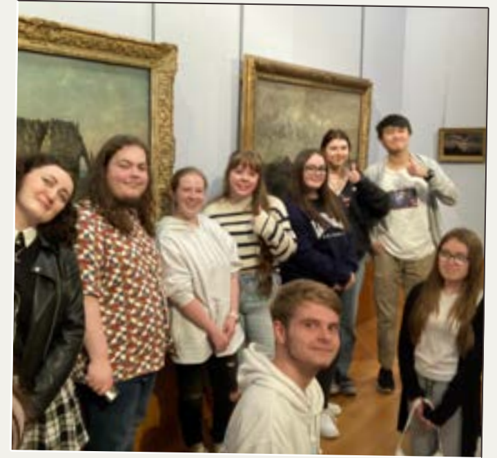
At the Barber Institute

Would you recommend Past-Futures? 100% YES